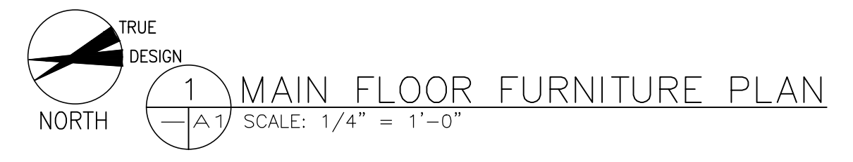
1 MAIN FLOOR FURNITURE PLAN SCALE: 1/4" = 1'-0"